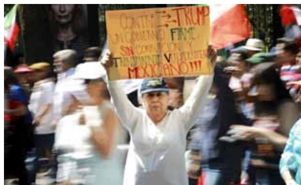
LATIN AMERICA: Thousands march in Mexico to demand respect > 15