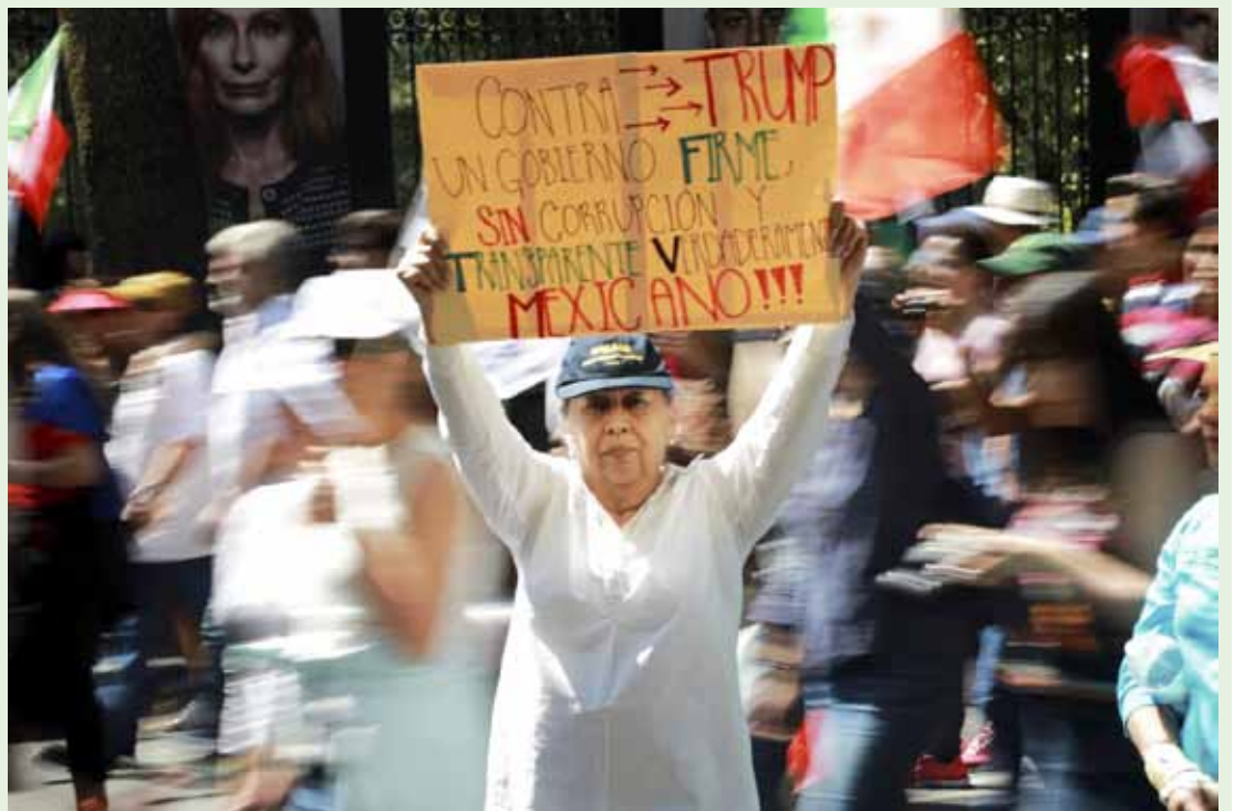
A woman holds up a banner that reads in Spanish: "Against Trump", during a march demanding respect for Mexico and its migrants, in the face of perceived hostility from the administration of U.S. President Donald Trump, in Mexico City, Sunday, February 12, 2017.

Smaller marches were held in other Mexican cities Sunday.