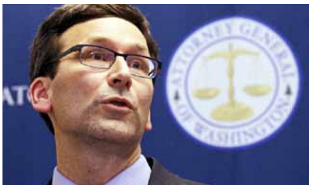
STATE: Top lawyer uses strategic streak to fight Trump > 18

Immigrants wait in fear after raids > 19