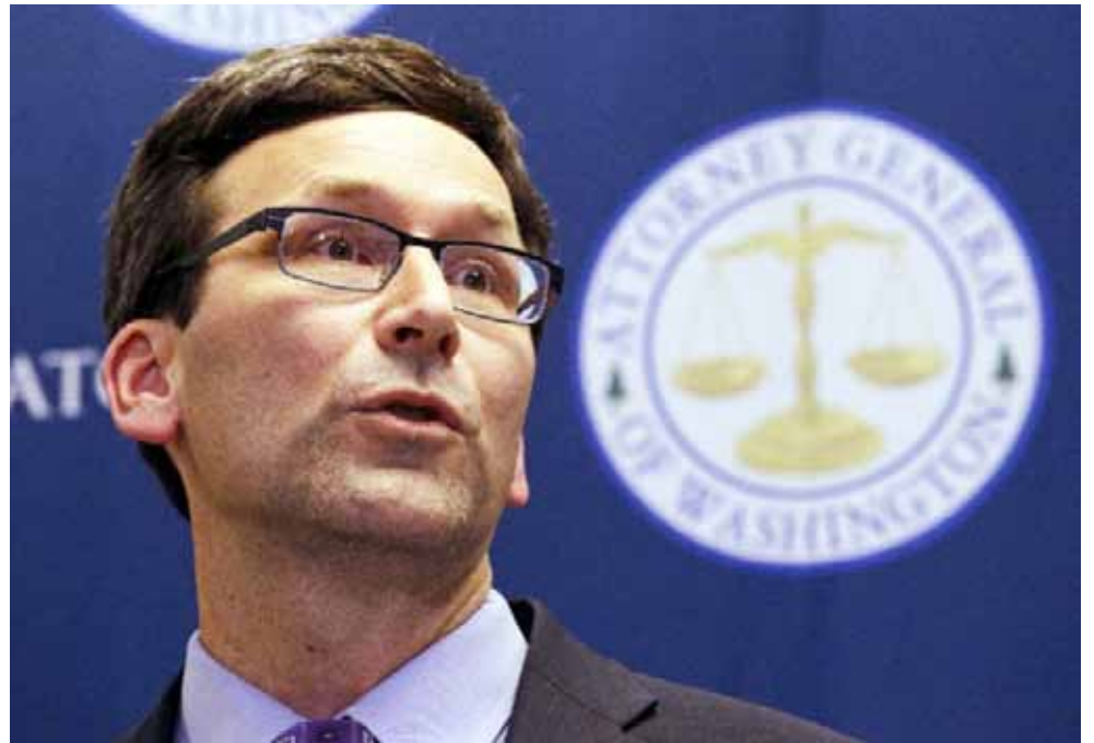
In this Thursday, February 9, 2017, file photo, Washington state Attorney General Bob Ferguson speaks during a press conference in Seattle, Washington.

He has filed consumer protection lawsuits against major computer technical support and student loan companies over what he described as predatory practices; sued President