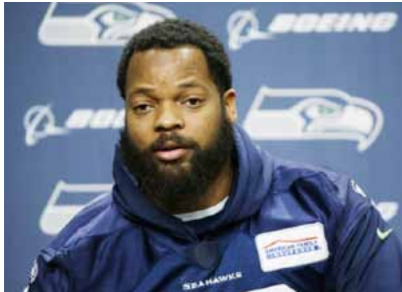
In this January 10, 2017 file photo, Seattle Seahawks defensive end Michael Bennett talks to reporters, in Renton, Washington.

Erdan leads the ministry for strategic affairs and public diplomacy, which works to boost Israel's image and counter the influence of an international boycott movement. His ministry declined to comment Sunday.