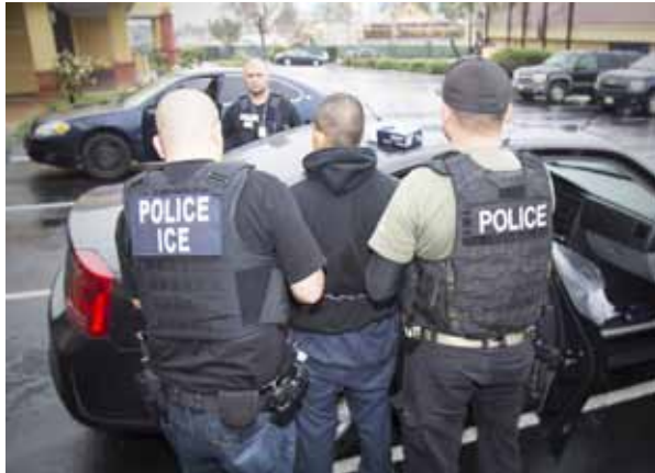
In this Tuesday, February 7, 2017, photo released by U.S. Immigration and Customs Enforcement, foreign nationals are arrested during a targeted enforcement operation aimed at immigration fugitives, re-entrants and at-large criminal aliens in Los Angeles, California.

Advocates and immigration lawyers scrambled to contain the panic and to orga-