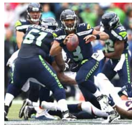
Seattle Seahawks quarterback Russell Wilson (3) evades a tackle during an NFL preseason game, Friday, August 14, 2015, in Seattle, Washington.

The biggest highlight for Seattle was the electric debut of rookie Tyler Lockett. Drafted primarily for his ability as a returner, Lockett took a kickoff back 103 yards for a touchdown in the second quarter after having a 46-yard return in the first quarter.