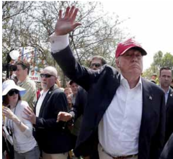
In this Saturday, Aug. 15, 2015, file photo, Republican presidential candidate Donald Trump waves to the crowd at the Iowa State Fair in Des Moines, Iowa.

Trump's remarks came as his campaign website posted his program for "immigration reform." Among its