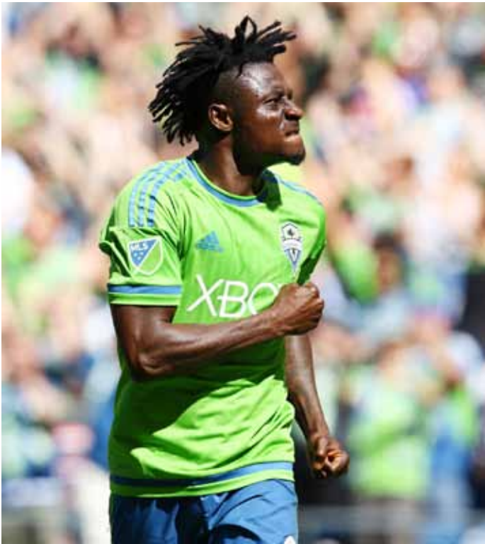
Seattle Sounders forward Obafemi Martins celebrates after scoring a goal during an MLS match on Sunday, August 16, 2015, in Seattle, Washington.