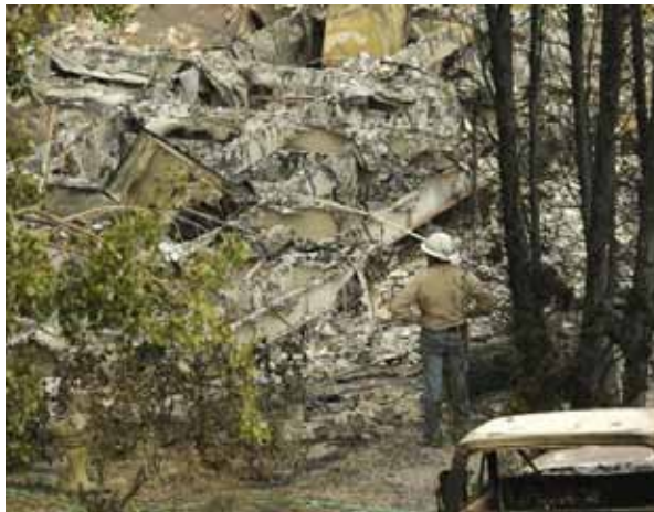
STATE: Big wildfire threatens resort town > 26