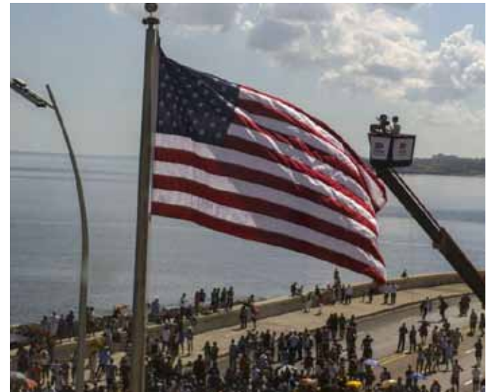
In this photo taken through a window, Cuban videographers film the U.S. flag from a crane after it was raised at the U.S. Embassy in Havana, Friday, Aug. 14, 2015.

"There is no way Congress will lift the embargo if we are not making progress on issues of conscience," he said.