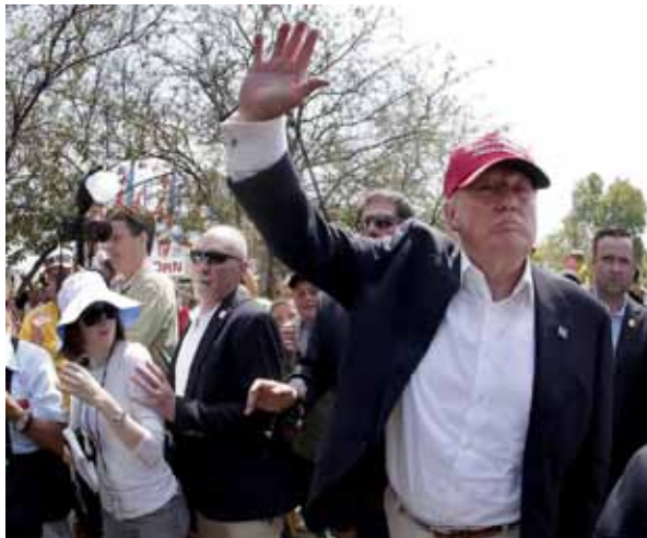
POLITICS: Trump would deny citizenship to children of undocumented immigrants > 23