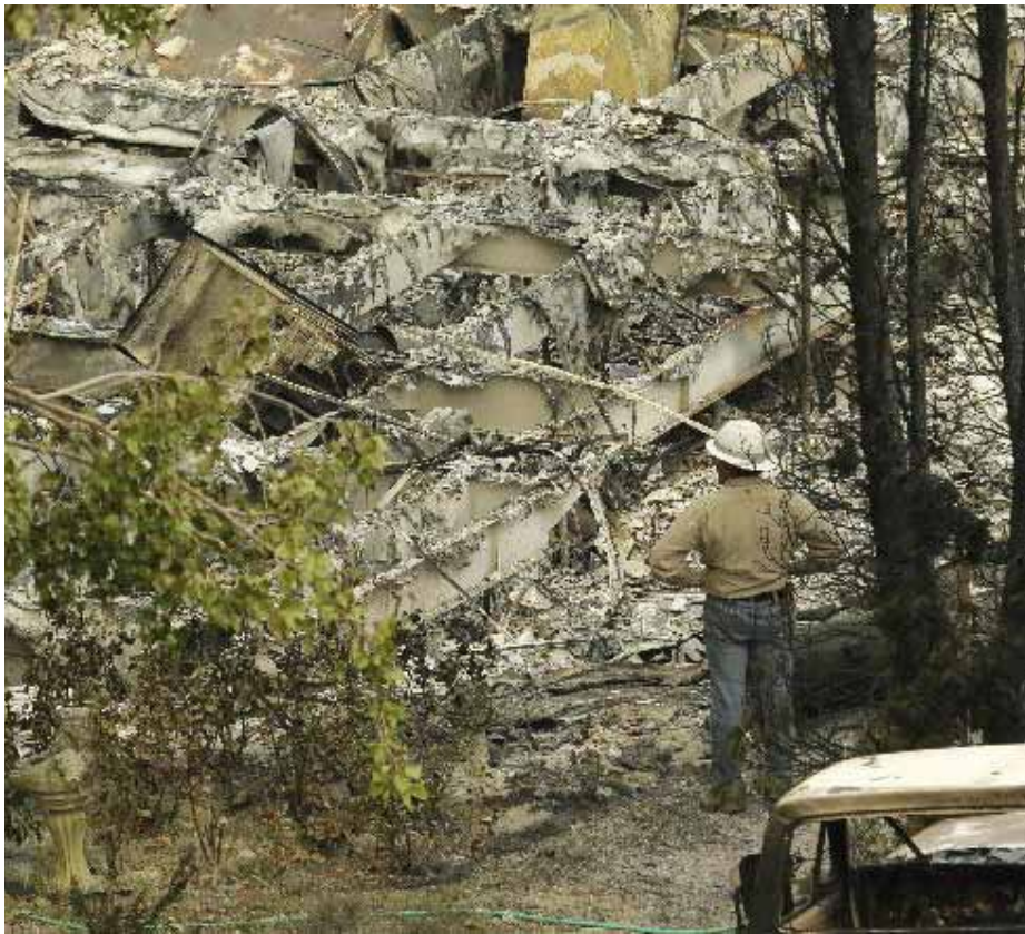
A Chelan County Public Utility District worker surveys a burned structure along State Route Alt. 97 highway Monday, Aug. 17, 2015, outside of Chelan, Washington.