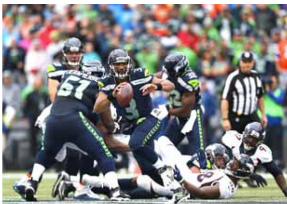
SPORTS: Seahawks lose in preseason opener > 22