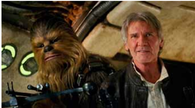
This photo provided by Lucasfilm shows Peter Mayhew as Chewbacca and Harrison Ford as Han Solo in "Star Wars: The Force Awakens," directed by J.J. Abrams.