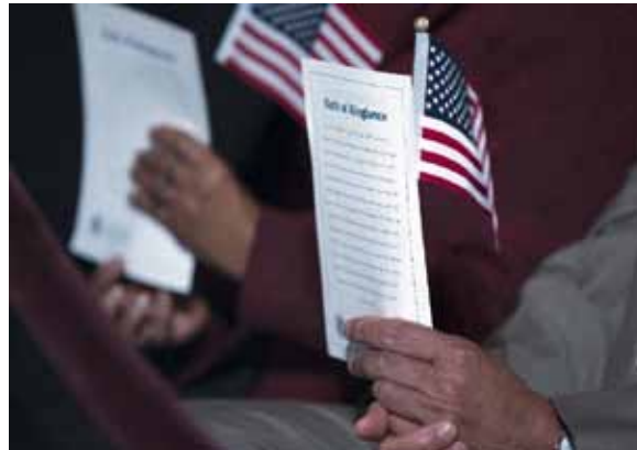
In this December 15, 2015, photo, participants hold the "Oath of Allegiance" and American flags during a naturalization ceremony attended by President Barack Obama at the National Archives in Washington.

Hispanics are far more likely to say they prefer a presidential candidate who would keep the president's immigration action in place than one who would prefer to undo it, by a 74 percent to 20 percent margin. More than half — 56 percent — say they could not imagine voting for a candidate