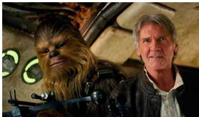
CINEMA: 'Star Wars' blasts opening weekend record > 15