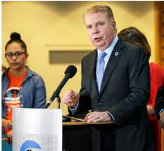
In this November 9, 2016 image, Seattle Mayor Ed Murray, second from the left, speaks at a post-election ceremony with elected officials and community leaders at the City Hall in Seattle, Washington.

It generally refers to jurisdictions that don't cooperate with U.S. Immigration and Customs Enforcement. That can mean, for example, that they don't notify immigration officials when an undocu-