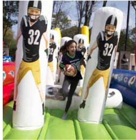
In this November 6, 2016 photo, a girl runs through an obstacle course set up at the American Football Expo in Mexico City.

Soon after, several teams were created in Veracruz and eventually the sport spread to Mexico City and local colleges. UNAM, the national state university with over 200,000 students, started playing in the 1920’s, and by the ‘50s, most of the Mexican colleges were playing the game that, at the time, rivaled soccer in popularity. UNAM’s famed Estadio