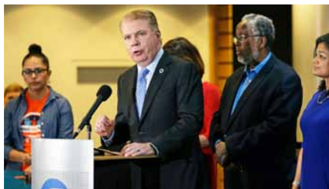
IMMIGRATION: 'Sanctuary cities' vow to protect immigrants > 18

Jennifer Lopez duets with Marc Anthony at Latin Grammys > 19