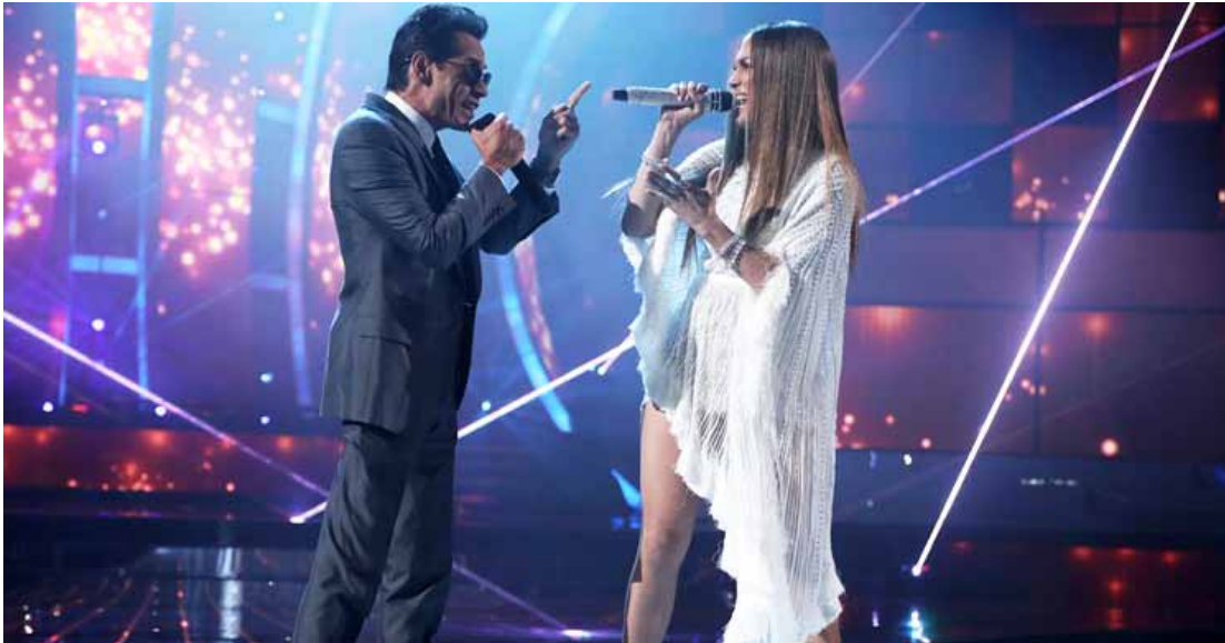
Marc Anthony, left, and Jennifer Lopez perform “Olvidame y Pega la Vuelta” at the 17th annual Latin Grammy Awards at the T-Mobile Arena on Thursday, November 17, 2016, in Las Vegas, Nevada.

“Marc, you are a living legend who has laid bare your heart and soul on your musical journey,” Lopez said in Spanish.