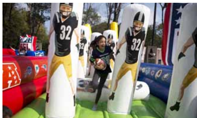
LATIN AMERICA: Mexico shows off its passion for American football > 15