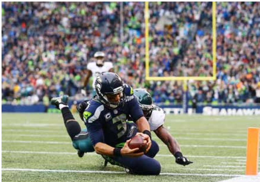
Seattle Seahawks quarterback Russell Wilson (3) dives into the endzone after making a touchdown catch during an NFL game on Sunday, November 20, 2016, in Seattle, Washington.

Wilson had already been giving the Eagles defense all kinds of fits before his touchdown catch. He used his mobility to buy extra time and found Jimmy Graham for a 35-yard touchdown pass in the second quarter, giving Seattle a 16-7 lead going into halftime that ended up being more than enough to get the win. Rookie